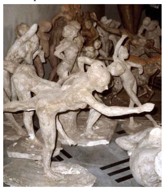
fig. 3. Plasters found in Valsuani's storage, December 2004.