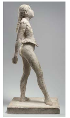
fig. 2 Unknown plaster.

About twenty years later, in 1976 there was another milestone in the history of Degas' sculptures. The Reid & Lefevre Gallery in London exhibited a previously undocumented set of bronzes owned by Nelly Hébrard.<sup>26</sup> Each bronze in the set was stamped with the word "Modèle" (model). Arthur Beale confirmed the Modèle set was a master set of bronzes from which, except for the Little Dancers , all the other bronzes (about 1,400 bronzes) were cast.<sup>27</sup> The set was sold through the Reid & Lefevre Gallery to the Norton Simon Art Foundation in 1977.<sup>28</sup> Today the Modèle bronzes are in the collection of the Norton Simon Museum of Art in Pasadena, California USA.<sup>29</sup>