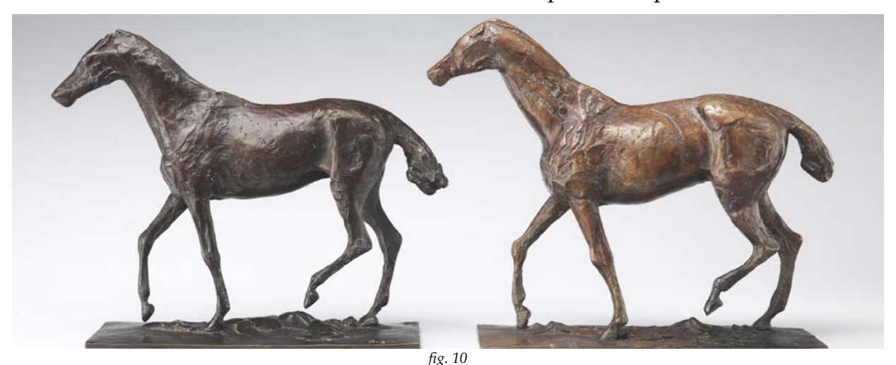
Hébrard Bronze Letter "HER D" cast from the Modèle Bronze Height (without bronze base): 20.5 cm Collection New Orleans Museum of Art

An example of the differences between a bronze cast from another bronze when compared to one cast from a plaster can be observed in fig. 10 . On the left is a surmoulage bronze, cast by Hébrard from another bronze (the Modèle bronze). When compared side-by-side with the Valsuani bronze cast from the plaster, it becomes very apparent that the surface details on the Valsuani bronze are sharper and superior.