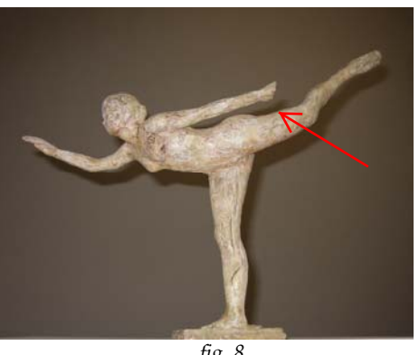
fig. 8 Recently discovered Plaster