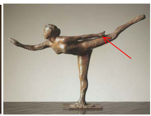
fig. 9 Hébrard Bronze

One can also determine something about the dating of a plaster by making the same type of side-by-side comparison. Wax no. 3 is shown in fig. 7 as photographed by Gauthier in 1917-1918. In fig. 8 is a photograph of the corresponding plaster. Notice on both the wax (fig. 7) and on the plaster (fig. 8) the figure's left arm is in the same extended outward position, whereas on the bronze in fig. 9 it is not. This clearly illustrates the plaster must have been made before the left arm on Degas' wax was moved downward for casting bronzes beginning in late 1919. This also rightly leads to following conclusion: the plaster must have been made from Degas' wax either during his lifetime or shortly after his death, and certainly no later than late 1919. Taking into account that many other such comparisons have been made<sup>45</sup> along with the measurement compilations noted above, and considering the other evidence provided in the large corpus of research, all points to the following logical conclusions: (a) except for only a few, all the plasters were made from Degas' waxes, (b) at least ten plasters were made from the waxes during his lifetime, 46 and (c) except for only a few, the plasters that were not made during Degas' lifetime were made from his waxes shortly after he died on September, 27 1917, and before Hébrard began casting any bronzes in late 1919.