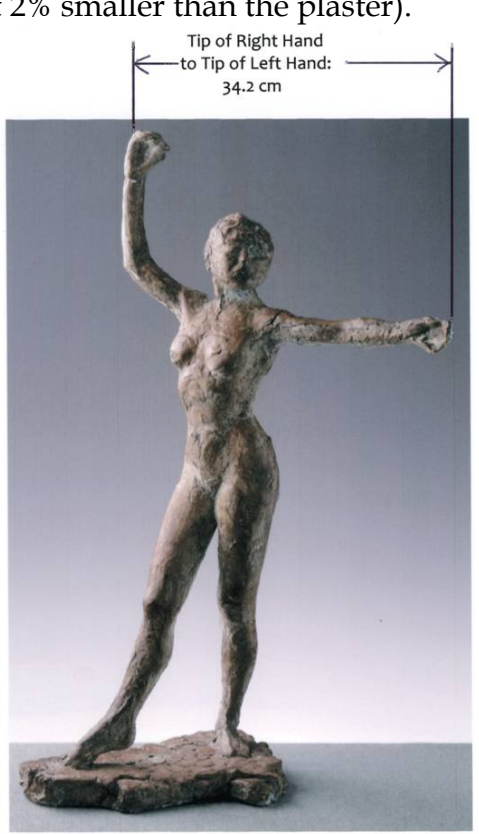
Recently discovered Plaster Number 57

Notice in fig. 4 the measurement from the tip of the figure's right hand to the tip of her left is greater on the plaster than it is on the Modèle bronze. This proves two things. First, the plaster could not have been made from the Modèle. Had it been the dimensions on the plaster would have been smaller matching those on the Modèle. Second, for the reasons noted above, the larger measurement on the plaster also indicates it was made