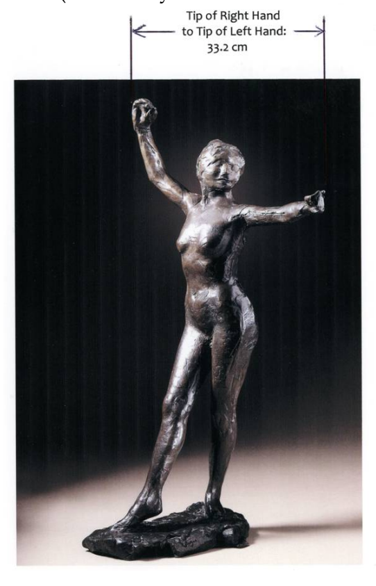
Modèle Bronze Number 57

While we may never know exactly when each plaster was made, or if they were made by Bartholomé, Palazzolo or perhaps by someone else, nonetheless, experts and scholars all agree that the critical question to determine authenticity was, and is; "Where the plasters made from Degas waxes?" If the answer is yes the plasters are authentic, no matter who made them or when. To provide evidence that the plasters were made from the artist's waxes a great number of internal (point-to-point) measurements were taken on the Modèle bronzes.<sup>39</sup> Those measurements were then compared to the same points on the plasters.<sup>40</sup> Why? Because in the casting process bronze shrinks by approximately 2% from its molten to its solid state.<sup>41</sup> Plaster has no such shrinkage.<sup>42</sup> Therefore, if one were to cast a sculpture in plaster from an original Degas wax, and then cast a sculpture in bronze from the same original wax, the plaster would be approximately 2% larger than the bronze (conversely the bronze would be about 2% smaller than the plaster).